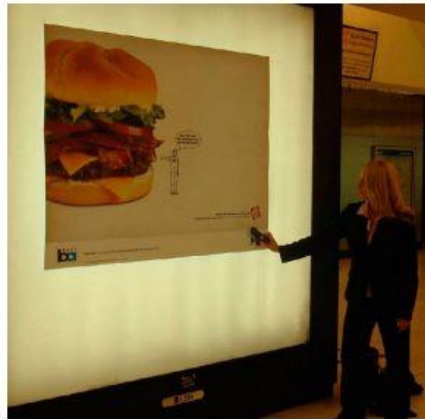
1. Tap your phone on "Find Your Burger" NFC Poster at the Powell BART Station in San Francisco